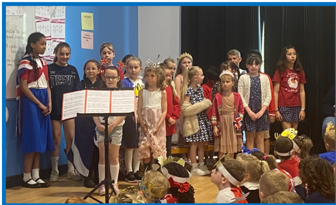
The choir singing in assembly ready for Sunday Evening.

Please remember due to the King's Coronation, Monday 8 th May is a Bank Holiday. Queensgate will be closed on Monday.