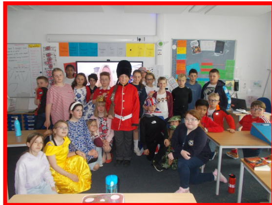
5RA on parade!