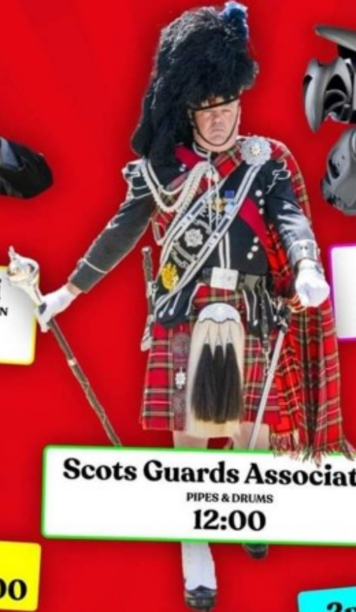
Scots Guards Association PIPES & DRUMS 12:00