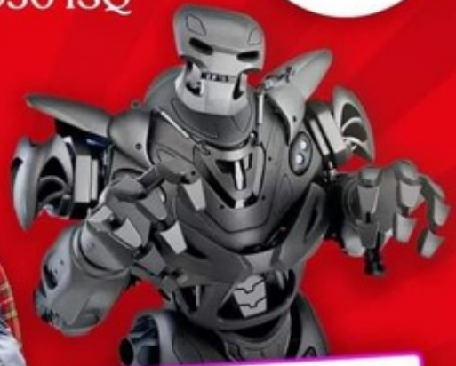
Titan the Robot AS SEEN ON BRITAIN'S GOT TALENT 11:00, 12:30 & 14:00